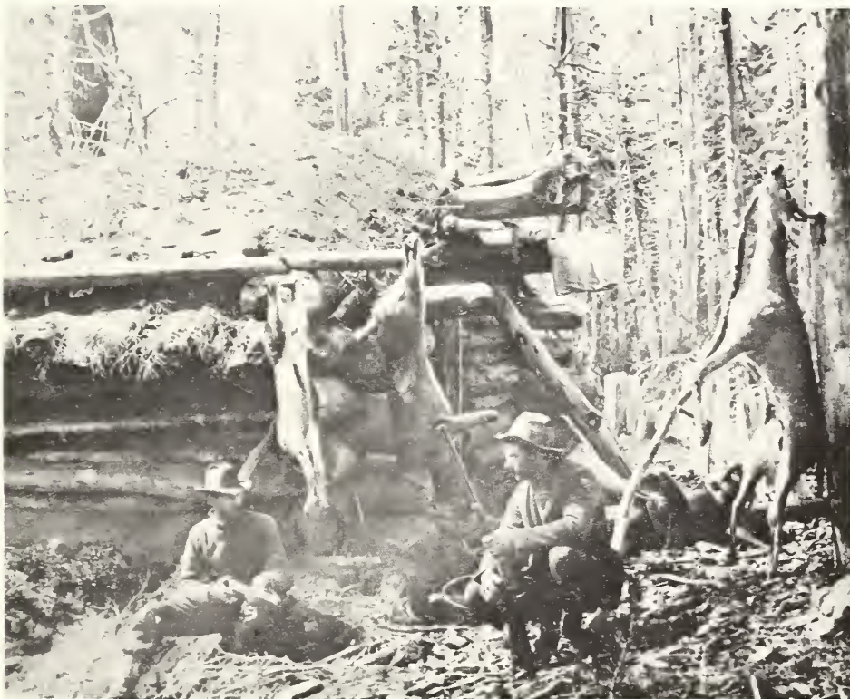
Figure 8. Scene at turn-of-the-century hunters' camp somewhere in Jackson County. Crude log cabin was typical of trapping and hunting shelters.

The list of 22 trapping, hunting and fishing sites has been collected largely through interviews with old timers, including retired F.S. employees. Early Forest Service recreation reports were also used. A majority of the Forest's possible sites (i.e., those at which some evidence remains) are probably recorded on the Preliminary Inventory.